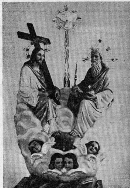
Sagrada Imagen de la SANTISIMA TRINIDAD que será bendecida y colocada mañana Domingo en la Catedral de esta ciudad.

Por otras razones complementarias, la pregunta de la Comisión se contesta negativamente, por lo cual es posible que no prospere la iniciativa de los vecinos de Siquirres.